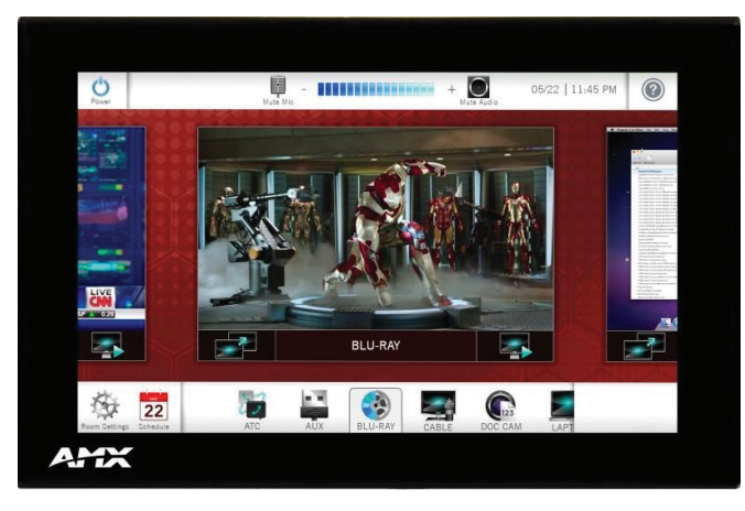
MD-702 (FG5969-55BL) Landscape Wall Mount Touch Panel