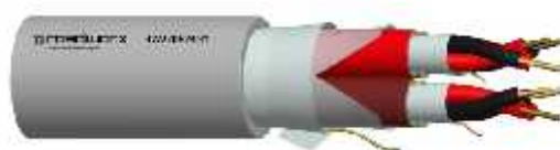
Cable Construction Drawing