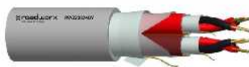
Cable Construction Drawing