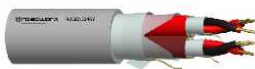
Cable Construction Drawing