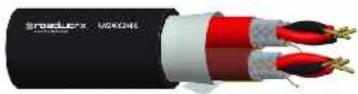
Cable Construction Drawing