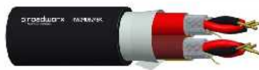
Cable Construction Drawing