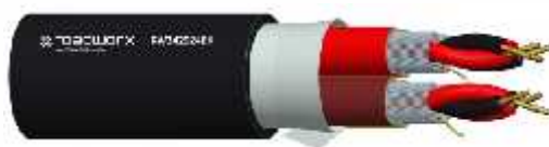
Cable Construction Drawing