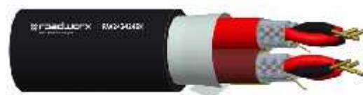
Cable Construction Drawing