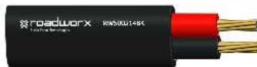
Cable Construction Relative Parts