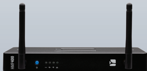
HMP400W with wifi